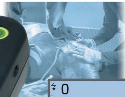
Chest compression depth gauge