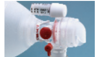
Disposable manometer permits visual control of lung pressure (pediatric and infant versions).