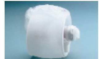
Folds for easy storage.