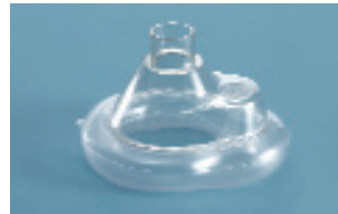
Choice of six convenient mask sizes.