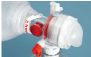
Pressure-limiting valve helps prevent overpressure in the lungs (pediatric and infant versions).

The incorporated handle and SafeGrip™ technology contributes even further to overall comfort, especially during prolonged critical events.