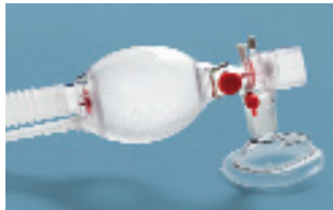
Ambu Spur II infant also available with reservoir tube.

Ambu SPUR II represents a complete family of resuscitators, including infant, pediatric, and adult sizes. All Ambu SPUR II resuscitators come in individual, resealable plastic carrying bags, complete with one or more masks and any special accessories. The bags themselves are color-coded for fast identification of infant, pediatric, and adult sizes.