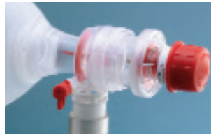
Direct PEEP connection for easy attachment.