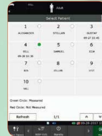
Patient status with color code