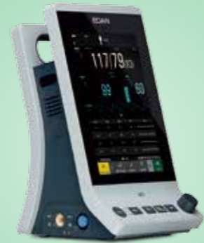
iM3 Vital Signs Monitor