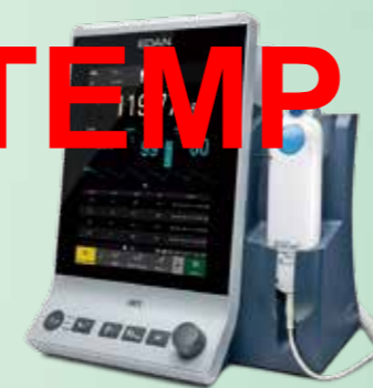
Infrared Ear TEMP