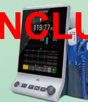
Covidien Quick TEMP