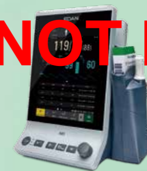
EDAN Quick TEMP