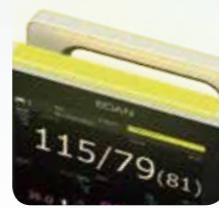
360° Alarm Light