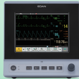
X8 Patient Monitor